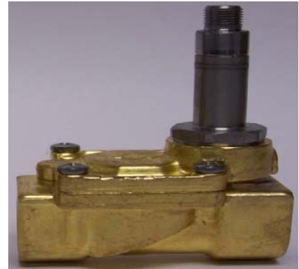
Series 200 solenoid

Kit Includes: Diaphragm, Piston and Springs