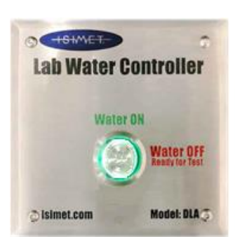
Push Button Option