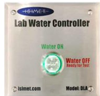
Push Button Option